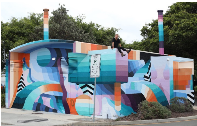
Water Walls Commonwealth Games Gold Coast Urban Art Project