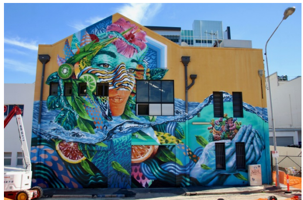
Mother Earth, Townsville