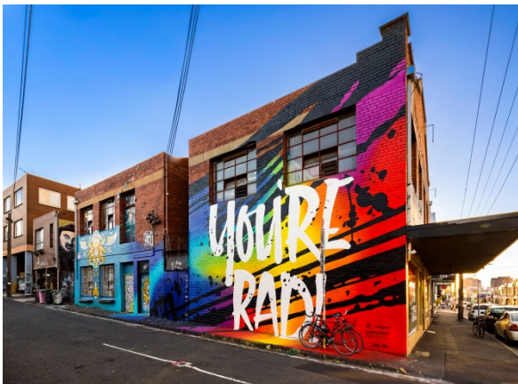
#KindComments for Instagram, Melbourne