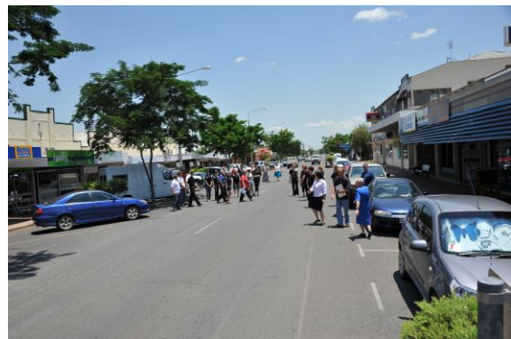
Kariboe St 11/11/11 @11am

Being the larger parks in Biloela, the continued development of Lion’s Park, Melton Park and Possum Park can be considered a priority by Council. Continued irrigation and planning would be of great benefit to the community utilising the parks.