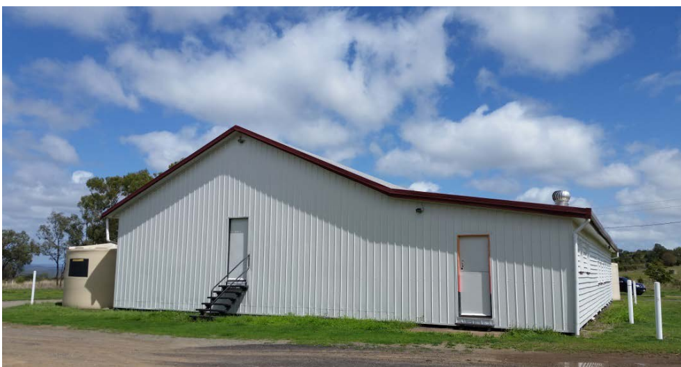
Lawgi Hall Currently