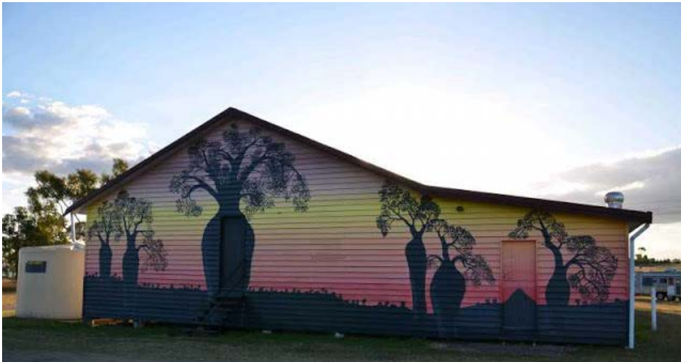
Previous Lawgi Hall Artwork